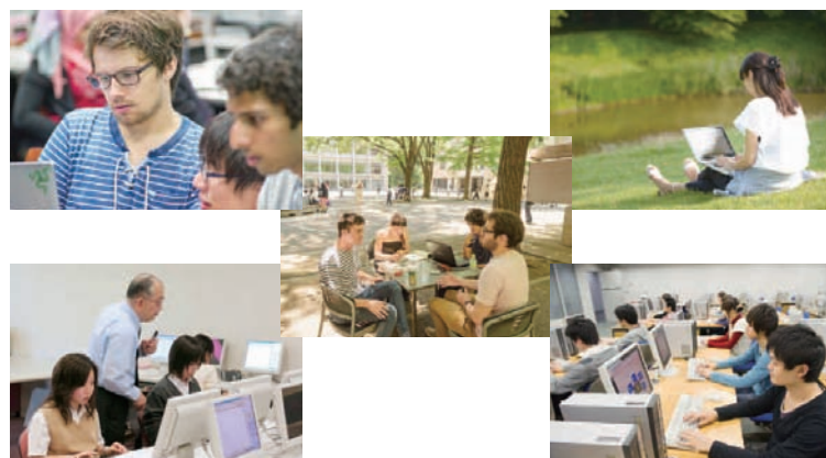
Keio Information Technology Center

1-5-30 Shibakoen, Minato-ku, Tokyo 105-8512